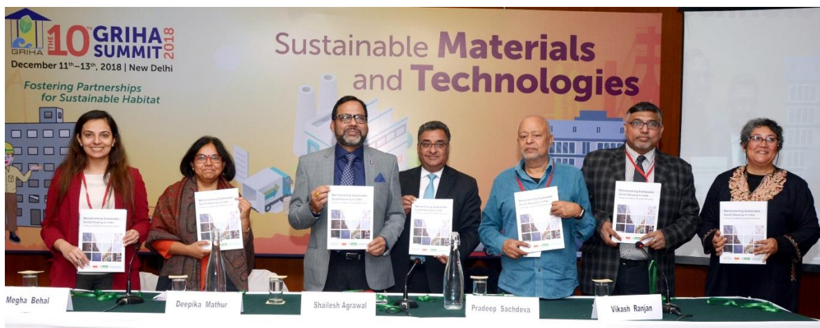
Figure 2: MaS-SHIP final project report launch at the 10 th GRIHA summit